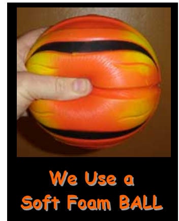
We Use a Soft Foam BALL